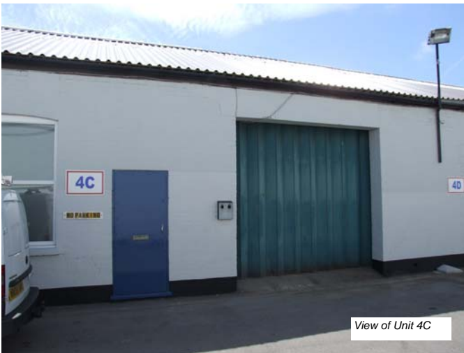
View of Unit 4C

Unit 4C at Triumph Trading Estate is suitable for Manufacturing or Storage and Distribution. The Unit has Office, WC and kitchen facilities and is prewired for internet and telephone connections.