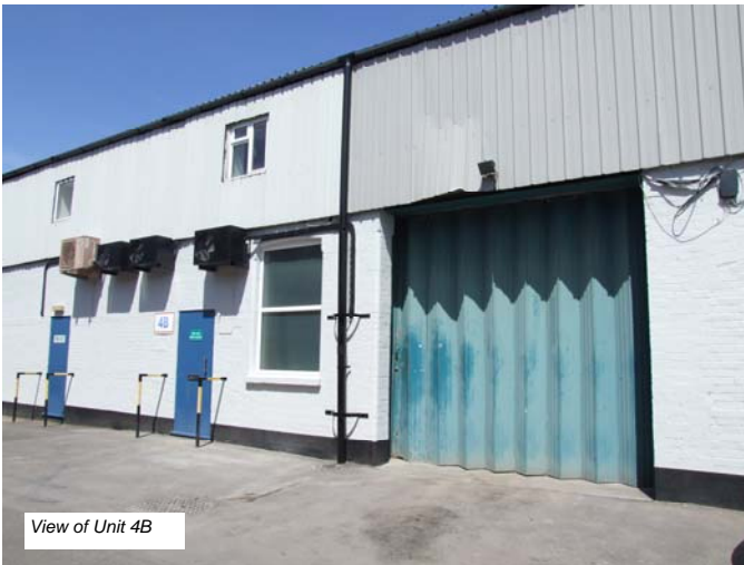
View of Unit 4B

Unit 4B at Triumph Trading Estate is suitable for Manufacturing or Storage and Distribution. The Unit has Office, WC and kitchen facilities and is prewired for internet and telephone connections.