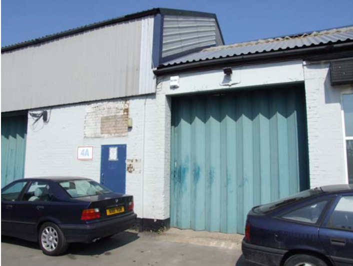
View of Unit 4A

Unit 4A at Triumph Trading Estate is suitable for Manufacturing or Storage and Distribution. The Unit has Office, WC and kitchen facilities and is prewired for internet and telephone connections.